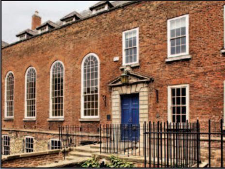
Front of Tailors Hall

On Saturday 19th May 2012 Freemasonry will revisit Dublin's historic Tailors Hall, the only surviving Guildhall in the city completed in 1706. This is where Grand Lodge regularly met from 1755 until 1818 on the first Thursday of every month. Indeed Freemason connections with the Tailor's Guild or "Fraternity of St John The Baptist of the Merchant Tailors of the City of Dublin" are probably older because in 1725 Grand Lodge retired to the Tailor's Church of St John The Evangelist, Fishamble Street, for a service of thanksgiving following the election of the first known Grand Master.