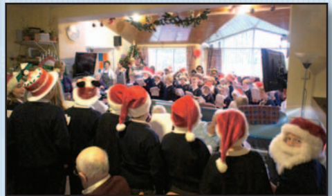
Billis Schoolchildren from Cavan

children enjoy all aspects of the day; We in Lodge Two have the easy part of only having to give small financial support to this very worthy cause.